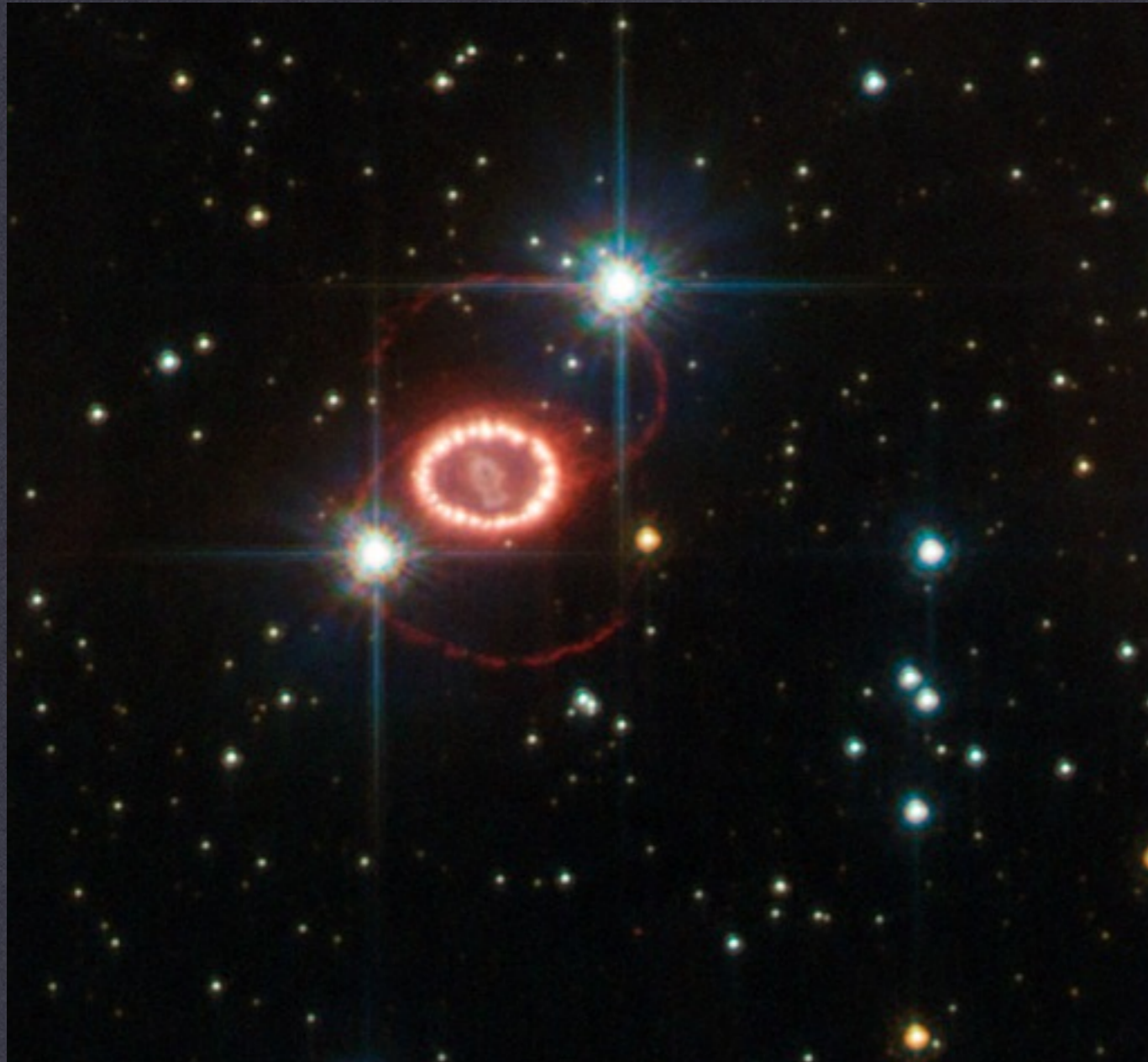
Supernova Remnant 1987a: The Origin of the Elements